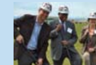
» Groundbreaking in Calgary-NW ... 3