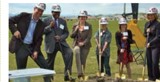
Officials and future students at the ground breaking for NW High School.

I was unable to attend due to a G-20 event in Toronto. CNW