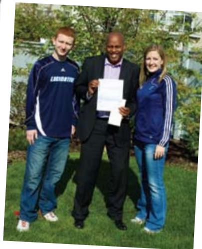
Presenting a cheque to members of the NW Locomotives Basketball team.