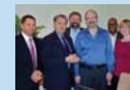
» Alberta Cabinet ministers travelled the province ... 2