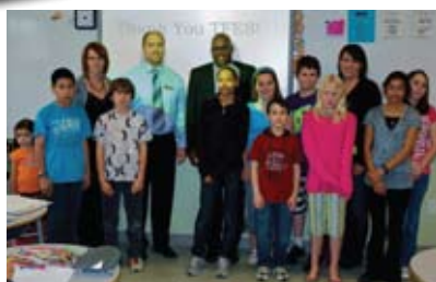
Visiting St. Basil School to present cheque for technology upgrades.