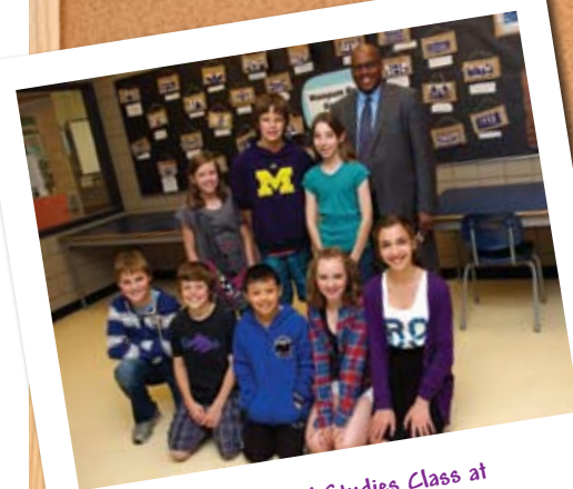
Visiting Grade 6 Social Studies Class at Arbour Lake School.