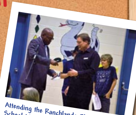
Attending the Ranchlands Elementary School Musical Event and cheque presentation.