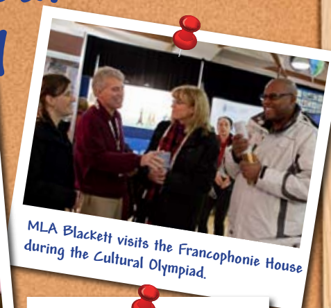
MLA Blackett visits the Francophonie House during the Cultural Olympiad.