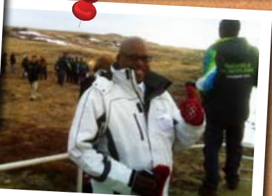
Visiting the Torch Relay at Head Smashed In Buffalo Jump.