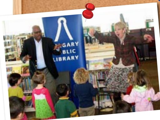
Story telling at Crowfoot Library.