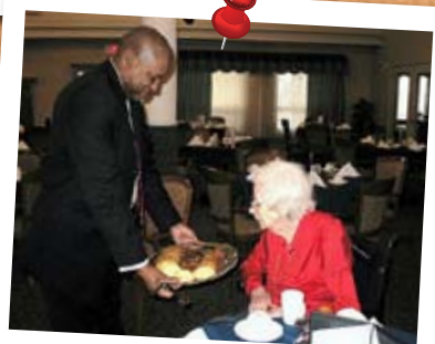
MLA Blackett visits residents at Scenic Acres to sing carols.